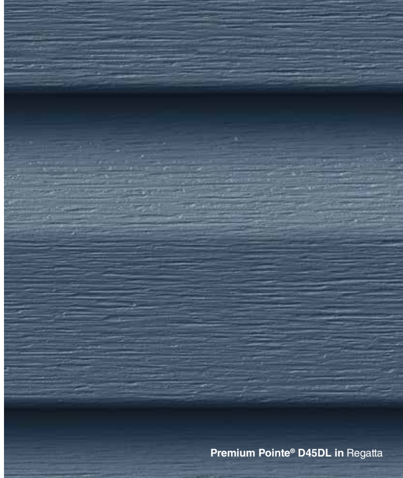
Premium Pointe® D45DL in Regatta