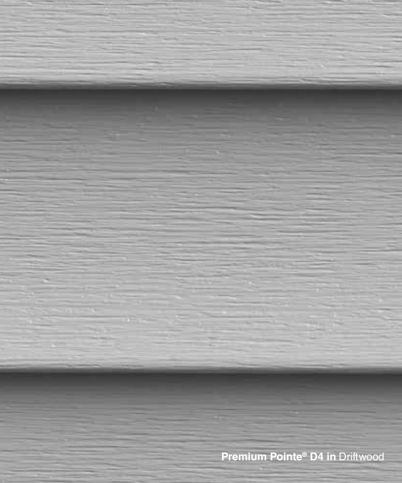
Premium Pointe® D4 in Driftwood